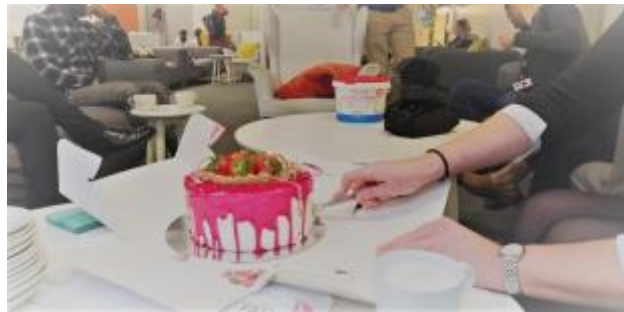
15 - The Liverpool team get together for coffee and cake...reportedly baked at home and expertly packaged !