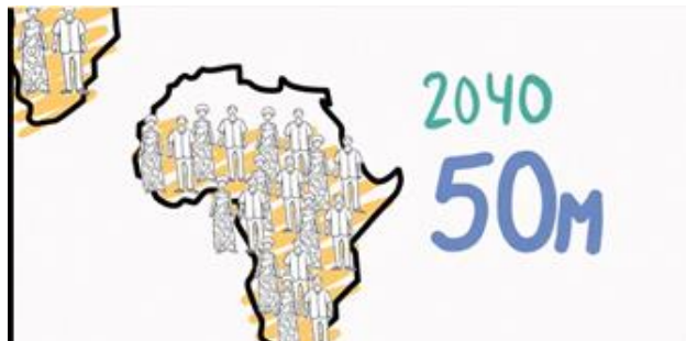
10 - A sneakpreview of the animations for the META3 trial video

Anu was back in the recording studio to read the script for the short, animated film for META 3 trial, which we hope to launch in the next few weeks.