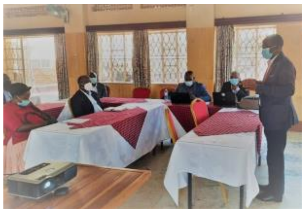
5 - Prof Moffat addressing a meeting of Ugandan MoH health facility managers and district health officers.

2400 participants have now completed 12 months of follow up. In Uganda, the team convened a meeting of health facility managers and district health officers from four districts to discuss what should