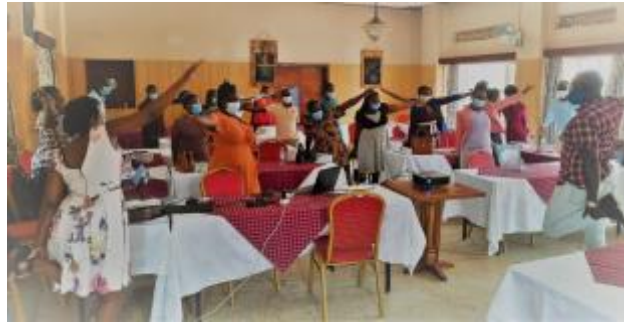
14 - The Uganda INTE-AFRICA team stay active during a study planning meeting!